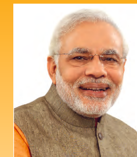
SHRI NARENDRA MODI Hon'ble Prime Minister, India