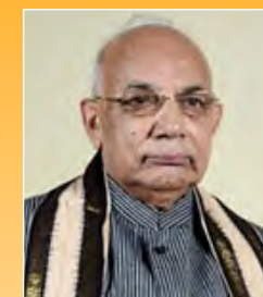
PROF. KAPTAN SINGH SOLANKI Hon'ble Governor of Haryana