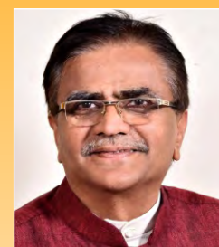
SHRI OM PRAKASH DHANKAR Hon'ble Agriculture Minister, Haryana